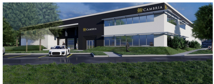
An exterior rendering of Cambria's Sales and Distribution Center in Milford, MA.