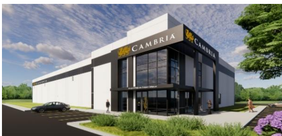
Exterior renderings of Cambria's sales and distribution centers in Manassas, VA; Duluth, GA; and Houston, TX.

The three new builds are taking place in Houston, TX; Duluth, GA; and Manassas, VA; and a full gut renovation is underway at the purchased facility in Milford, MA.