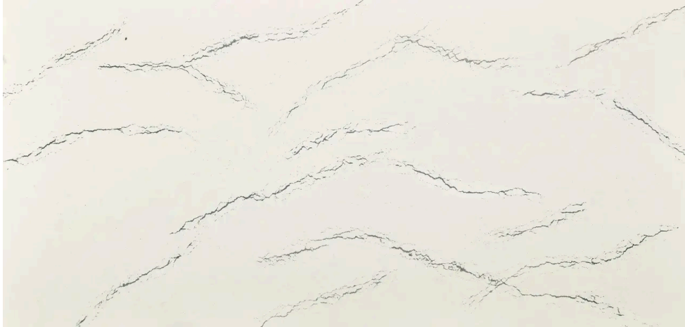
Berkshire Steel Satin Ridge™

Featuring a cool white base with subtle gray undertones and a raised steel alloy texture, this design achieves a serene yet powerful aesthetic. Its linear veining enhances Cambria's Satin Ridge™ offerings, perfectly balancing sophistication and strength.