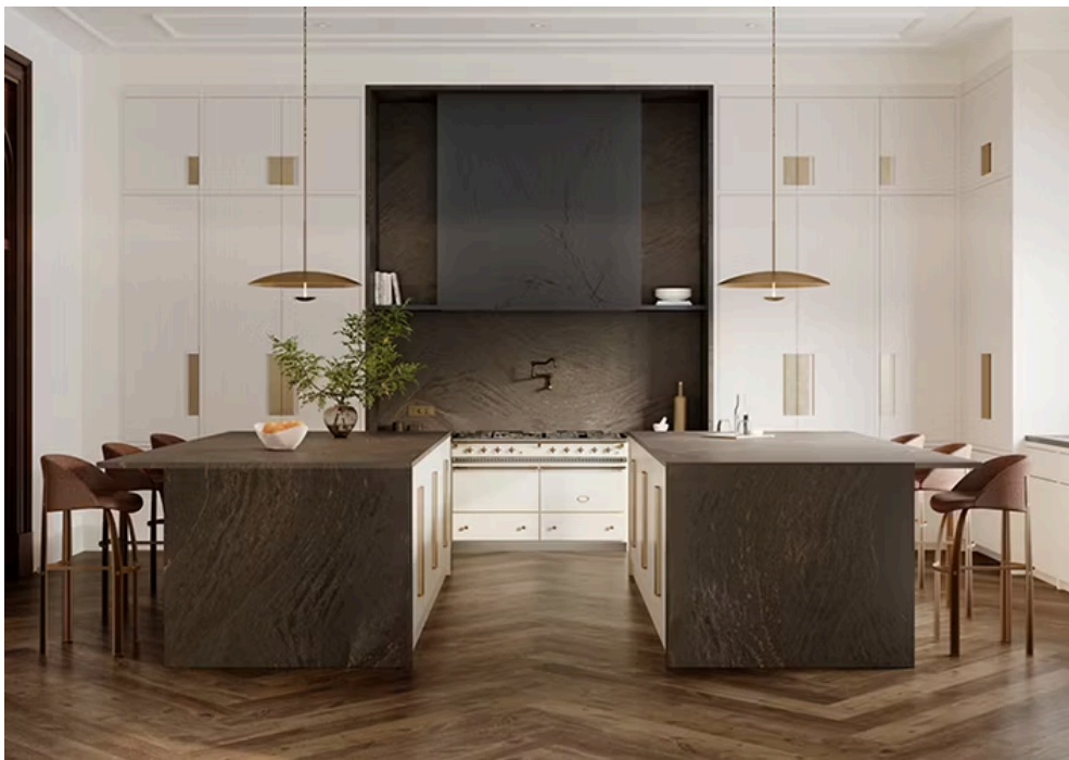
Design shown: new Remington Brass™ in Cambria Satin™ finish

Le Sueur, MN (February 25, 2025) — Cambria, the premier producer of American-made luxury quartz surfaces, proudly introduces four extraordinary designs at this year's Kitchen and Bath Industry Show (KBIS) in Las Vegas, February 25–27. Displayed at the show in all-new curated vignettes that wow, these new trendsetting designs embody Cambria's dedication to visionary design, exceptional craftsmanship, and innovative technology pushing the boundaries of what quartz surfaces can achieve.